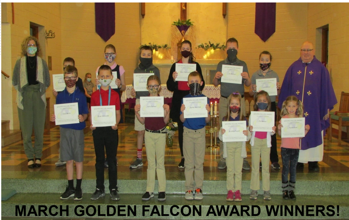
MARCH GOLDEN FALCON AWARD WINNERS!