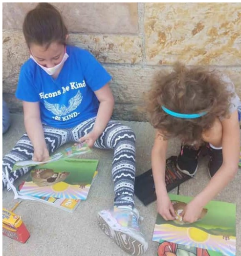
Below: Jesus has risen! First grade also enjoyed the beautiful weather as they assembled stickers to show the resurrection!