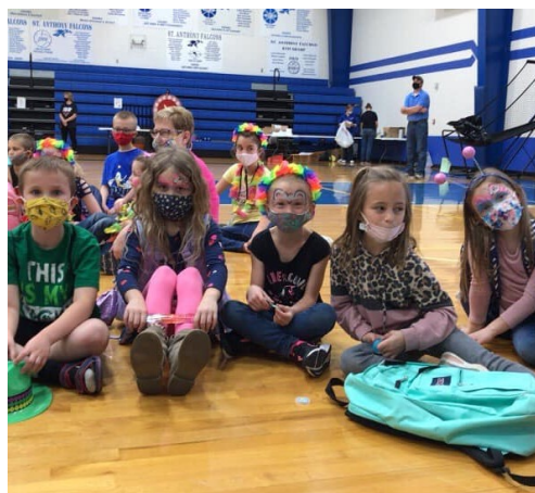
Below: St. Anthony PreK - 8th grade students enjoyed a fun-filled afternoon of food, games, prizes, & raffles at the Annual Children's Festival.