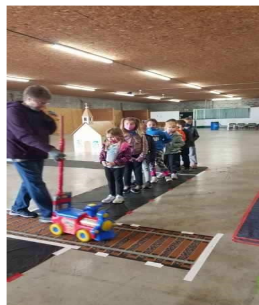
Above: Kdgn & 1st grade students travelled to Safety City at the Putnam Co. Fairgrounds to learn about bike, pedestrian, railroad & swim safety.