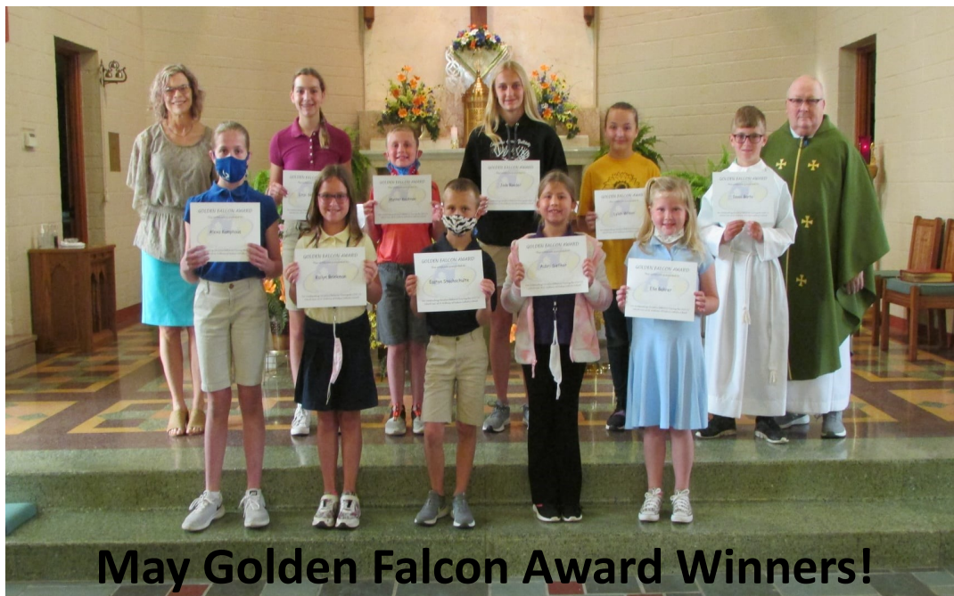
May Golden Falcon Award Winners!