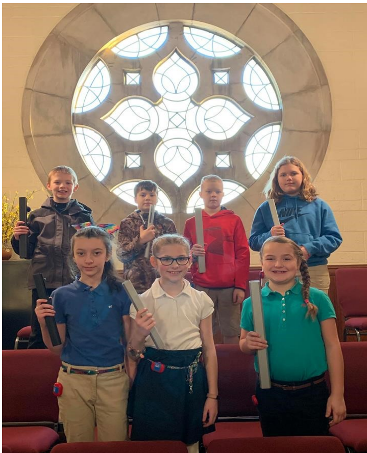
Below: March Golden Falcon Award Winners!