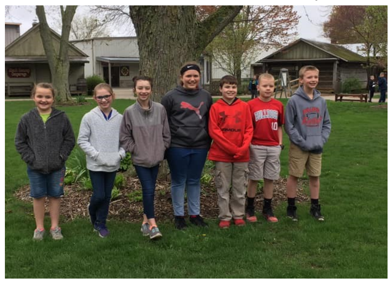
4th graders pose for a group photo at Sauders's Village.

~ St. Anthony Mission Statement adopted March 9, 2016~