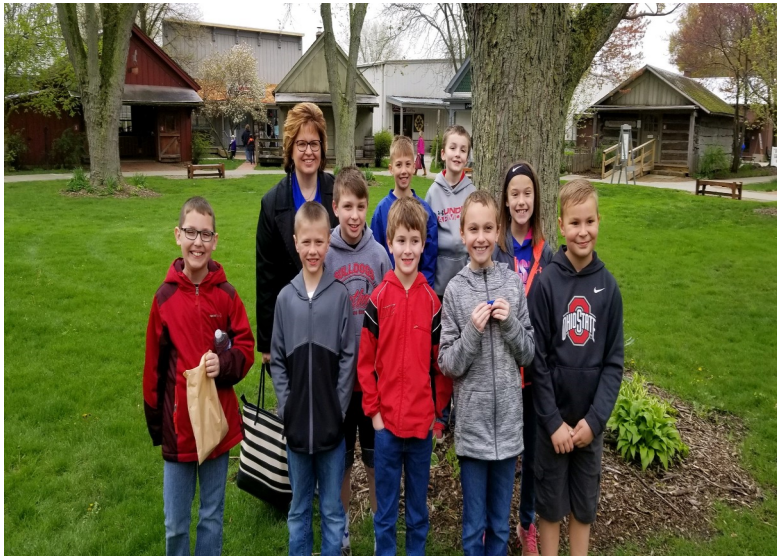
3rd graders pose for a group photo at Sauders's Village.

~ St. Anthony Mission Statement adopted March 9, 2016~