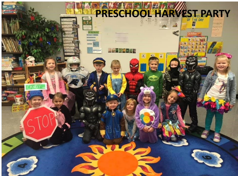
PRESCHOOL HARVEST PARTY