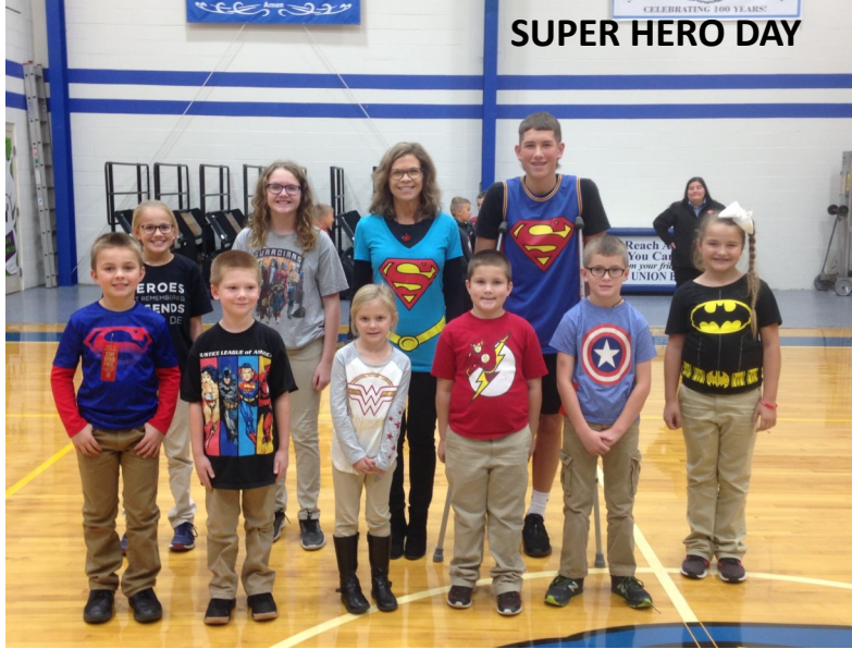
SUPER HERO DAY