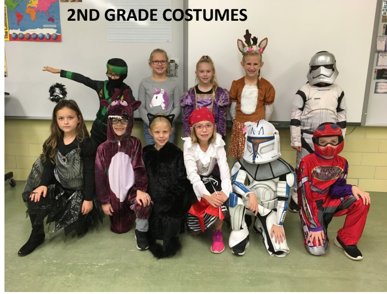
2ND GRADE COSTUMES