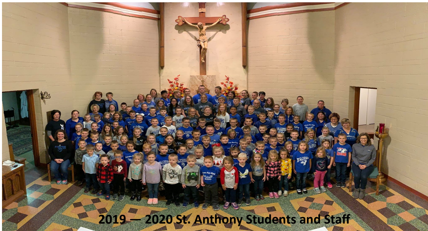
2019 — 2020 St. Anthony Students and Staff