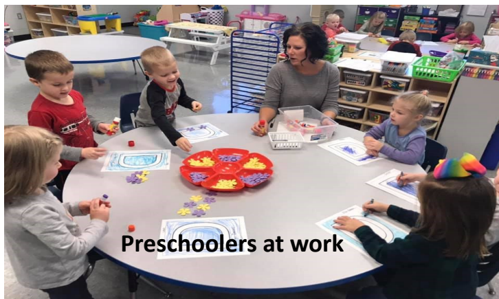
Preschoolers at work