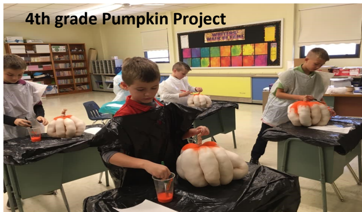
4th grade Pumpkin Project