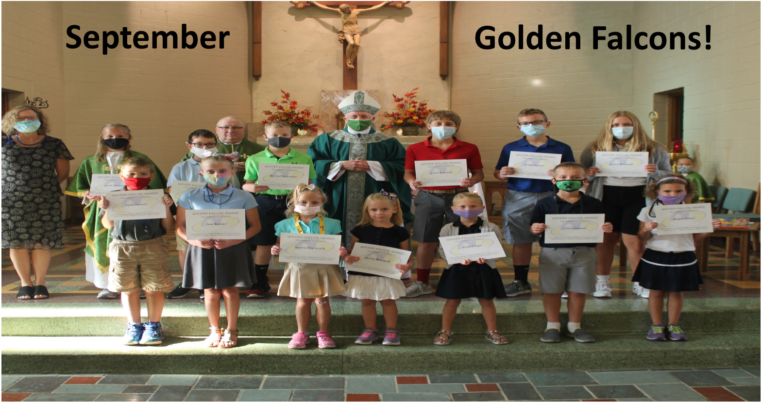
Above, Front Row, L to R