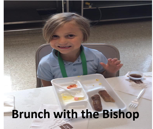
Brunch with the Bishop