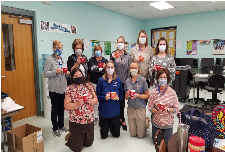
One of our wonderful parents delivered Biggby mugs and coupons.