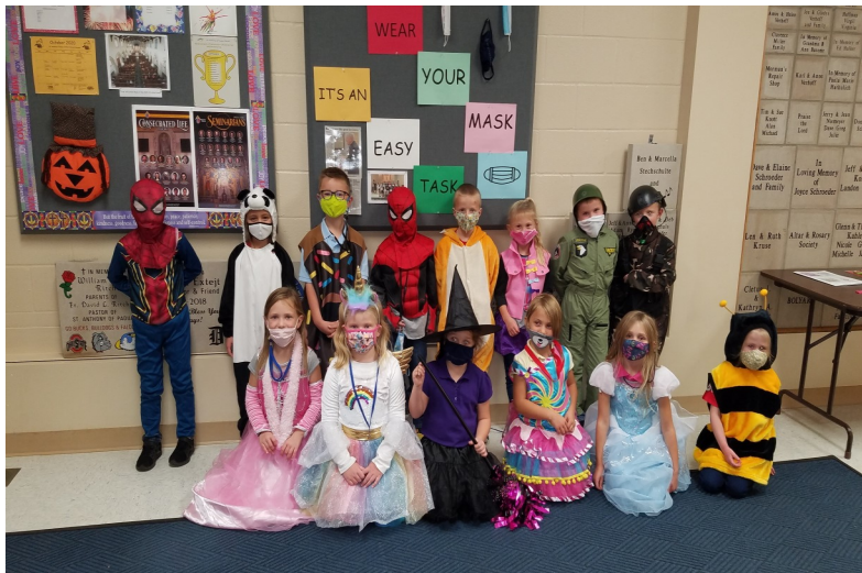
Kindergarten students recently held their Harvest Party.

"Jesus Christ is the reason St. Anthony of Padua School exists. He guides our staff, students, and parents to work collaboratively to strengthen the quality of our educational and spiritual community. He is the unseen but ever present teacher in our classes. He is the model of our faculty and the inspiration for our students to live Gospel values." ~ St. Anthony Mission Statement ~