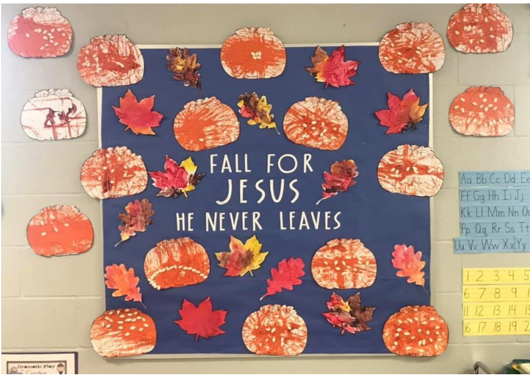
Preschoolers decorated their classroom for Fall.