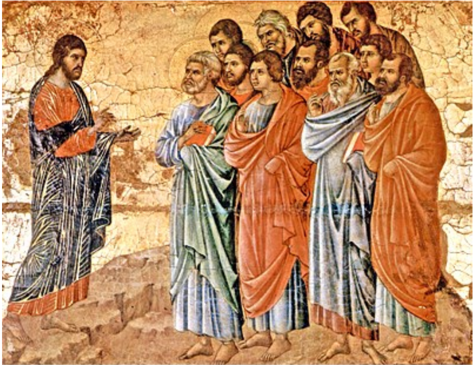
The sending of the Twelve by Duccio di Buoninsegna