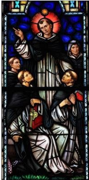
Stained glass window from St. Dominic's Church in Washington, D.C.

On May 14, 1217, Pentecost, Dominic gathered his 16 friars at Prouille and told them of his intention to scatter them and send them throughout the world. Many of the brethren were surprised by the announcement and objected, but Dominic said, "Do not object to this, for I know what I am doing. The world henceforth is your home, and the work God has ordained for you is preaching and teaching. Go ye, therefore, into the world and teach all nations. Preach to them the glad tidings of their redemption. Have confidence in God, for the field of your labors will one day widen to the uttermost ends of the earth." The actual dispersal of the brethren took place on August 15, 1217, without money or provisions. They were sent to Paris, Spain, Rome, and Bologna, chiefly to cities and university towns, where the friars could study, engage with new ideas, and recruit new friars. By the time of Dominic's death, 500 friars were settled as far as Hungary, Denmark, and England. By the end of the 13th century, there were 404 priories and almost 15,000 friars including a province in the Holy Land.