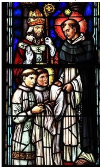
Stained Glass Window St. Dominic's Church in Washington, D.C.

Bishop Ivo Odrowatz, the Polish bishop of Krakow, was witness to Dominic's miracle of raising Napoleon Orsini, nephew of Cardinal Stephen, to life at San Sisto. The bishop's two nephews, Ceslaus and Hyacinth, and two companions, Henry of Moravia and Herman the Teutonic, were also witnesses. The bishop begged Dominic to send some of his friars to Poland, but the difficulty of the Polish language was an obstacle. Instead Dominic told the bishop, "My lord, you have with you four young clerics; give them to me. I will clothe them with our habit, form them to apostolic virtues, and return them to you in a short time full of zeal and devotedness." After 6 months of study with Dominic, the four new friars returned to Poland and began to preach the Gospel and founded five Dominican houses, which became centers of learning and preaching. Ceslaus traveled to Prague, Breslau, Bohemia, Pomerania, and Saxony. Hyacinth traveled throughout northern Europe, including Denmark, Sweden, and Norway, and even into parts of Russia. St. Hyacinth of Poland was canonized on April 17, 1594 (feast day August 17) and Blessed Ceslaus was beatified on August 27, 1712 (feast day July 17).