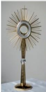
Monstrance blessed by Pope St. John Paul II