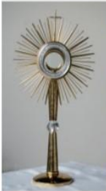
Monstrance blessed by Pope St. John Paul II