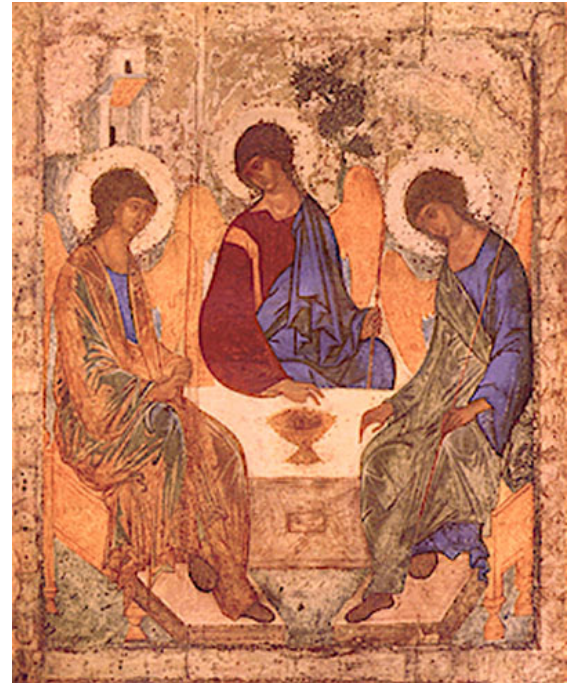
Icon: Andrei Rublev, Trinity, 1410

“The grace of the Lord Jesus Christ and the love of God and the fellowship of the Holy Spirit be with all of you.”