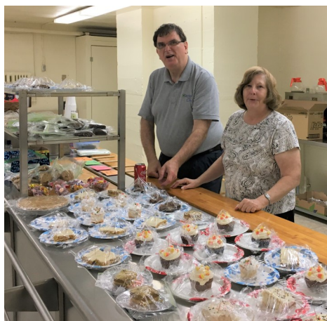
Fantastic volunteers and a whole bunch of delicious desserts!