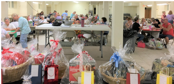
151 event baskets + 15 themed baskets + 1 great crowd = 100% fun event!