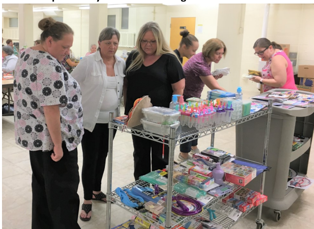
Door prizes for everyone in attendance!