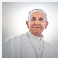
Pope Francis August 30, 2021

What is the secret of a blessed life, a happy life? Recognizing Jesus as the living God. For it is not important to know that Jesus was great in history. What matters is the place I give him in my life.