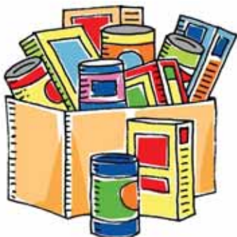
La Despensa De San José

El programa navideño para ayudar a las familias parroquianas con problemas financieros con los regalos de los niños ya está abierto. Los registros para el Arbol de la Generosidad estarán abiertos durante el mes de octubre para registrarse, llamar al 678-822-1357 para hacer una cita.