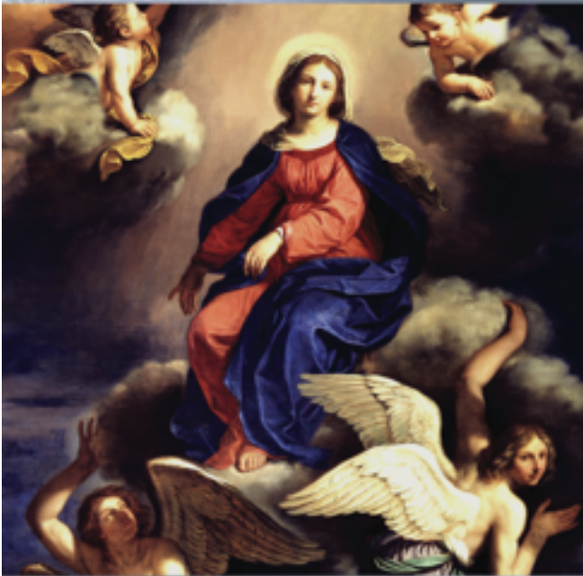
THE ASSUMPTION OF THE Blessed Virgin Mary