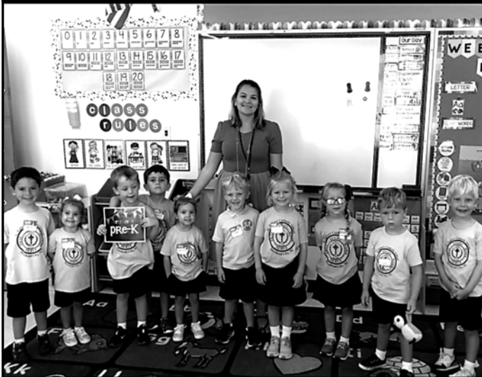
Class of 2026

And the year has begun! Our first day of school went wonderfully well. We had lots of smiles from children and parents as everyone poured into the school on Thursday, August 22nd. As we begin the 63rd school year, we are reminded of the youngest group (Pre-schoolers) eventually becoming our oldest group (5th graders). I am sure some of our 5th graders can remember their very first day at St. Egbert, and now as the “big” kids in the school, we hope they can share what they have learned with all of our younger students. It has started off to be a great year. Please continue to pray for our school and all of our children, families, and teachers. We are blessed to have such a wonderful school.