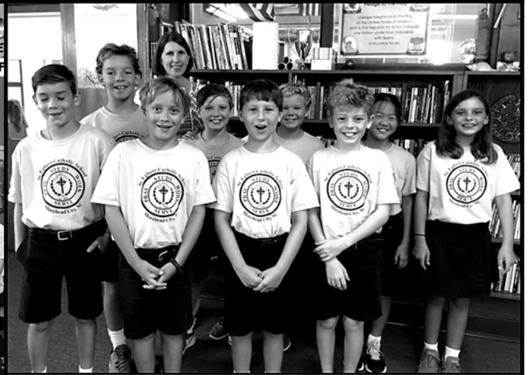
Class of 2020