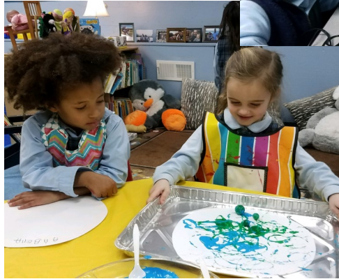
Pre-K learns about space