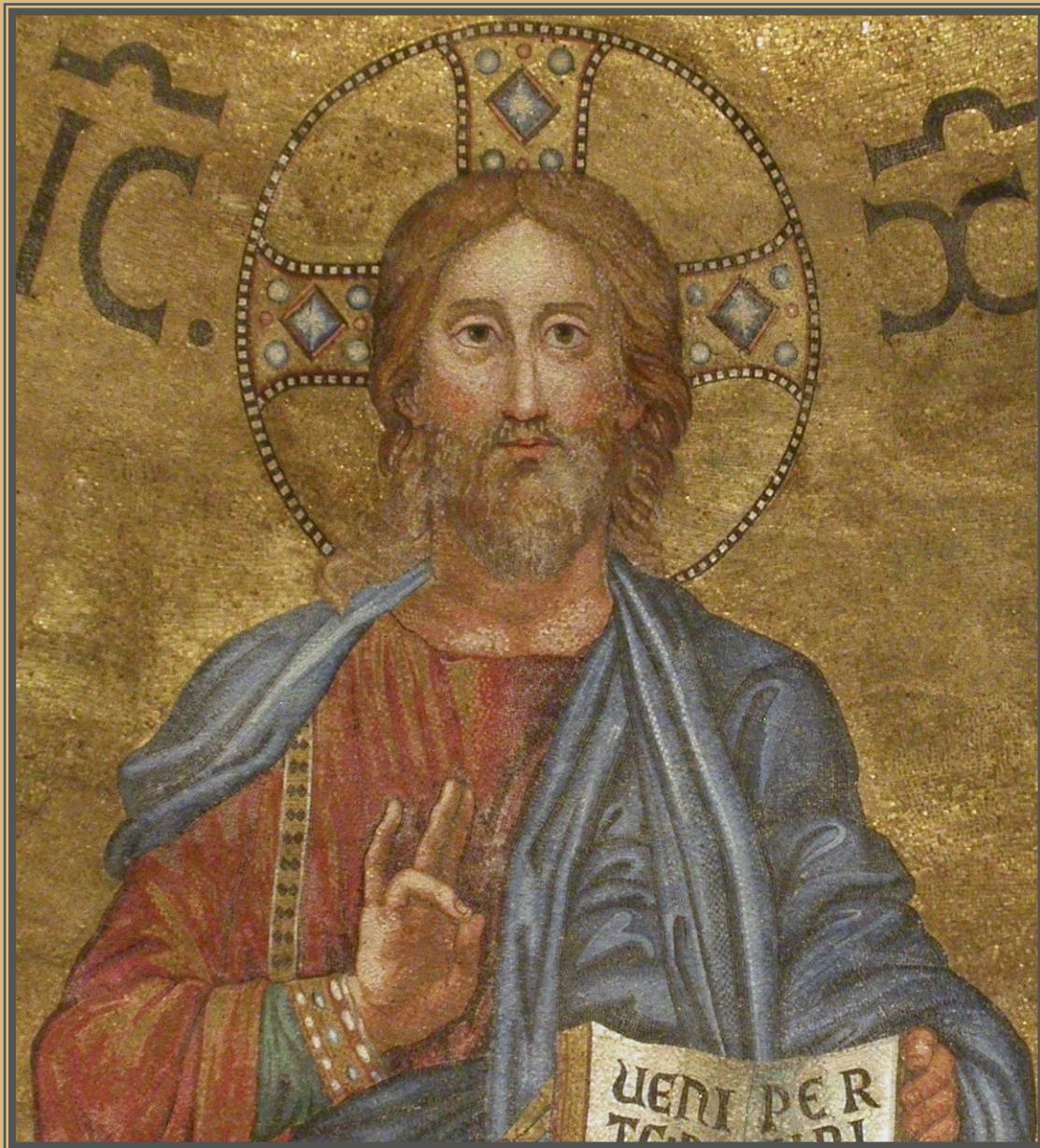
Jesus Christ in tile mosaic from the apse of St. Paul Outside the Walls, Rome, Italy

“Now you are Christ’s body, and individually parts of it.”