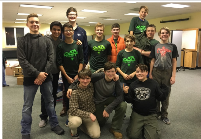
Troop 41 Boy Scouts starting the setup for our annual Fair

50 gift bags, for male and female veterans, will be put together on Sunday, November 11 for Veteran's NE Outreach Center—Haverhill. We are asking for donations: travel size personal hygiene items, perfume, cosmetics, playing cards, socks, mints, notepads, pens, Dunkin' Donuts gift cards, candy, gum, hat, gloves, etc. Please label your bag "Veterans Donations" and leave in the back of either church.