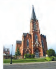
St. Henry St. Henry