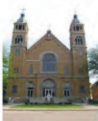
St. Bernard Burkettsville