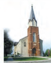
St. Wendelin Wendelin