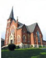
St. Francis Cranberry