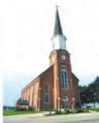
St. Aloysius Carthagen