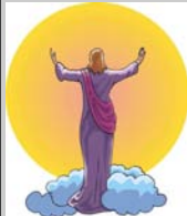
As they were watching, he was lifted up, and a cloud took him out of their sight. ACTS 1:9

Come and join us as we BUILD OUR FUTURE!