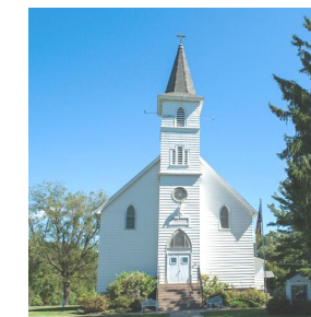
St. Joseph Parish-Fairview N13740 Fairview Rd Fairchild WI 54741-8514 715-964-5201