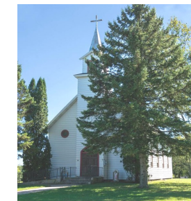
St. John Cantius Parish 306 2nd St. Fairchild WI 54741-8514 715-964-5201

Dear Parishioners of Immaculate Conception, St Joseph, and St John Cantius!