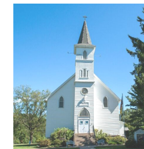
St. Joseph Parish-Fairview N13740 Fairview Rd Fairchild WI 54741-8514 715-964-5201