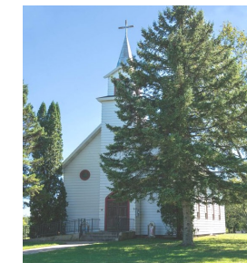
St. John Cantius Parish 306 2nd St. Fairchild WI 54741-8514 715-964-5201

Dear Parishioners of Immaculate Conception, St Joseph, and St John Cantius!