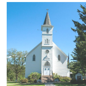
St. Joseph Parish-Fairview N13740 Fairview Rd Fairchild WI 54741-8514 715-964-5201