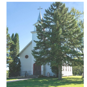
St. John Cantius Parish 306 2nd St. Fairchild WI 54741-8514 715-964-5201

Dear Parishioners of Immaculate Conception, St Joseph, and St John Cantius! We are approaching several very important Marian feasts. The Feast of Immaculate Conception on December 8th and the Feast of Our Lady of Guadalupe on December 12th.