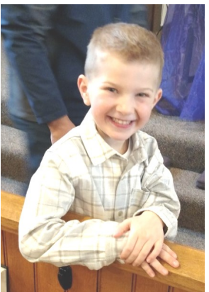
Cousin Cam really wanted to be included in the pictures. How could I resist this face!