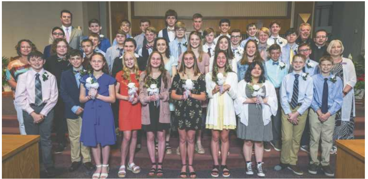
Holy Trinity Catholic School - Class of 2021

May you have the wisdom to find your purpose, and the courage to make a difference, using the gifts God blessed you with.