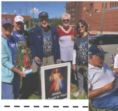
St. Paul Parish and Knights of Highland at Granite City.