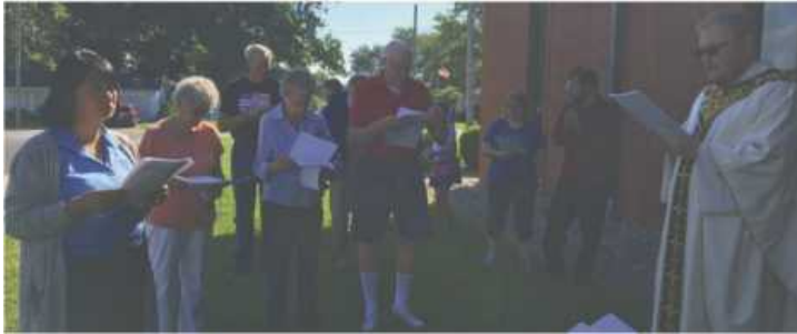
Upper left and bottom are from The National Day for Remembrance of Aborted Children at Immaculate Conception in Pierron. Upper right is from 40 Days for Life vigil in Granite City.