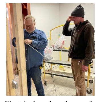
Electrical work underway for basement restoration

A Catholic Relief Services' Program to assist & support the needy by our prayers & financial support: the Catholic Relief Services' Lenten faith-in-action program. It offers each of us opportunities for our family to engage daily with the spiritual pillars of Lent: prayer, fasting and almsgiving. Also gives us an opportunity as a parish to come together as a community and reflect on living our Gospel call to encounter those most in need.