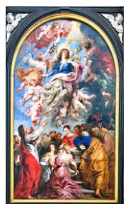
Assumption of the Blessed Virgin Mary

CONFESSIONS: Sat. 3:00 - 3:45 PM - Holy Family Church or by appointment