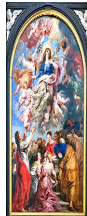
Assumption of the Blessed Virgin Mary

MONTHLY ROSARY: Monday, August 30 at 6:30 PM in Sts. Peter & Paul Chapel