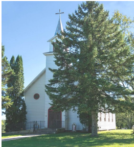
St. John Cantius Parish 306 2nd St. Fairchild WI 54741-8514 715-964-5201

Dear Parishioners of Immaculate Conception, St Joseph, and St John Cantius!