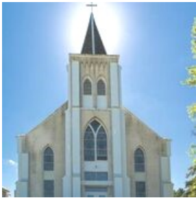
Immaculate Conception Parish 341 W Main St PO Box 188 Alma Center WI 54611-0188 715-964-5201