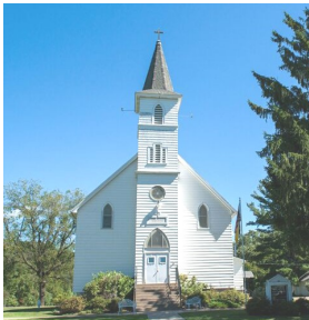
St. Joseph Parish-Fairview N13740 Fairview Rd Fairchild WI 54741-8514 715-964-5201