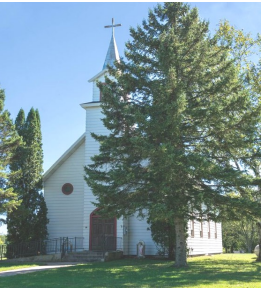
St. John Cantius Parish 306 2nd St. Fairchild WI 54741-8514 715-964-5201

Dear Parishioners of Immaculate Conception, St Joseph, and St John Cantius!