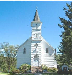
St. Joseph Parish-Fairview N13740 Fairview Rd Fairchild WI 54741-8514 715-964-5201