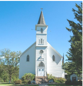
St. Joseph Parish-Fairview N13740 Fairview Rd Fairchild WI 54741-8514 715-964-5201