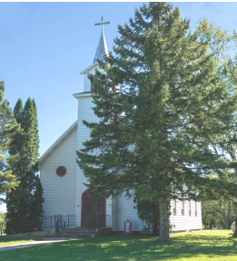
St. John Cantius Parish 306 2nd St. Fairchild WI 54741-8514 715-964-5201

Dear Parishioners of Immaculate Conception, St Joseph, and St John Cantius!