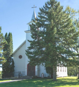
St. John Cantius Parish 306 2nd St. Fairchild WI 54741-8514 715-964-5201

Dear Parishioners of Immaculate Conception, St Joseph, and St John Cantius!