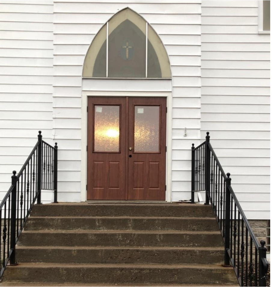
The new doors are in at St Joseph's! Aren't they beautiful!