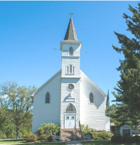
St. Joseph Parish-Fairview N13740 Fairview Rd Fairchild WI 54741-8514 715-964-5201