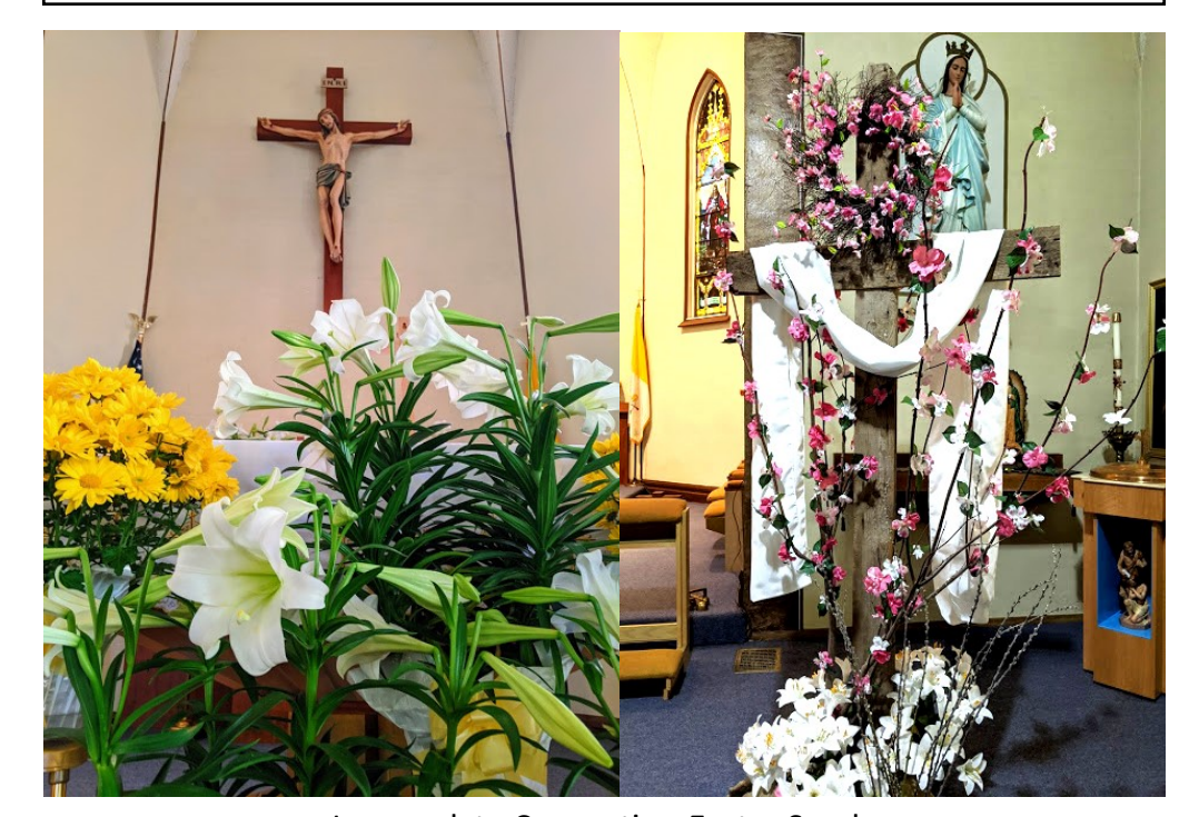
Immaculate Conception-Easter Sunday

"Sorrow!" the dying man exclaimed in a very faint voice. "You are wrong! I took St Joseph as my patron saint and model and, like him, I have never complained of my lot. I knew neither hate nor envy; my sleep was peaceful. I worked hard by day, but I rested by night. The tools you see provided me with the bread I ate with delight. I was poor, it is true, but St Joseph was just as poor; and I have kept fairly well up to now. If I recover, which I doubt, I shall return to my workplace and continue to bless the hand of God who, up to now has taken care of me." (pg 126)