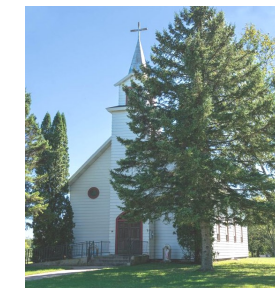
St. John Cantius Parish 306 2nd St. Fairchild WI 54741-8514 715-964-5201

Dear Parishioners of Immaculate Conception, St Joseph, and St John Cantius!