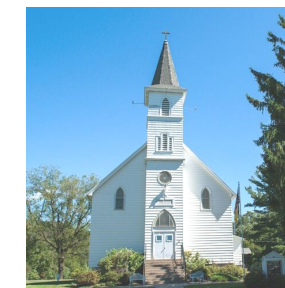
St. Joseph Parish-Fairview N13740 Fairview Rd Fairchild WI 54741-8514 715-964-5201