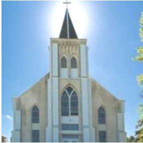
Immaculate Conception Parish 341 W Main St PO Box 188 Alma Center WI 54611-0188 715-964-5201