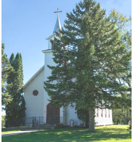
St. John Cantius Parish 306 2nd St. Fairchild WI 54741-8514 715-964-5201

Dear Parishioners of Immaculate Conception, St Joseph, and St John Cantius!