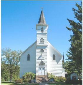
St. Joseph Parish-Fairview N13740 Fairview Rd Fairchild WI 54741-8514 715-964-5201