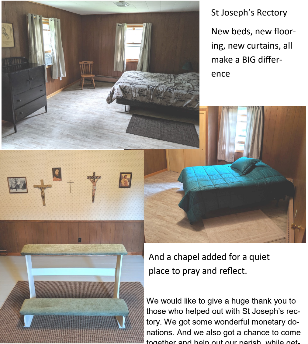
St Joseph’s Rectory

New beds, new flooring, new curtains, all make a BIG difference