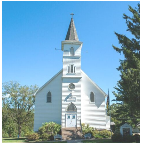
St. Joseph Parish-Fairview N13740 Fairview Rd Fairchild WI 54741-8514 715-964-5201