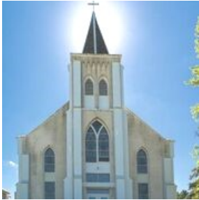
Immaculate Conception Parish 341 W Main St PO Box 188 Alma Center WI 54611-0188 715-964-5201