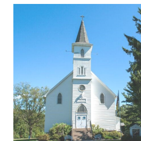
St. Joseph Parish-Fairview N13740 Fairview Rd Fairchild WI 54741-8514