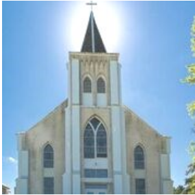
Immaculate Conception Parish 341 W Main St PO Box 188 Alma Center WI 54611-0188 715-964-5201

The ladies from Immaculate Conception met to discuss the annual roast beef dinner. They came to the decision that a drive up dinner would be best at this time. The dinner will be held Wednesday, August 11th from 4 to 6 pm. The cost of beef has doubled since the last dinner. We are asking all families of Immaculate Conception to please make a donation of $20 instead of signing up to bring certain items for the dinner. They will take the donated funds to purchase the things needed for the drive up dinner. They are asking the ladies to make pies or a refrigerated dessert. There is a sign up sheet on the bulletin board in the entryway. They also need people to work! People will be needed to run the food from the basement to the cars, and to help assemble the meals. We appreciate your donation and participation!