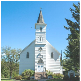
St. Joseph Parish-Fairview N13740 Fairview Rd Fairchild WI 54741-8514 715-964-5201