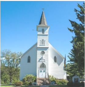
St. Joseph Parish-Fairview N13740 Fairview Rd Fairchild WI 54741-8514 715-964-5201

Dear Parishioners of Immaculate Conception and St Joseph!