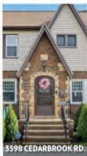
3598 CEDARBROOK RD.