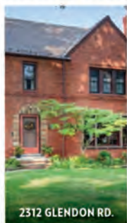
2312 GLENDON RD.

Helping clients buy and sell these beautiful homes in the Heights.