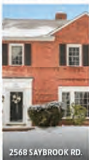
2568 SAYBROOK RD.