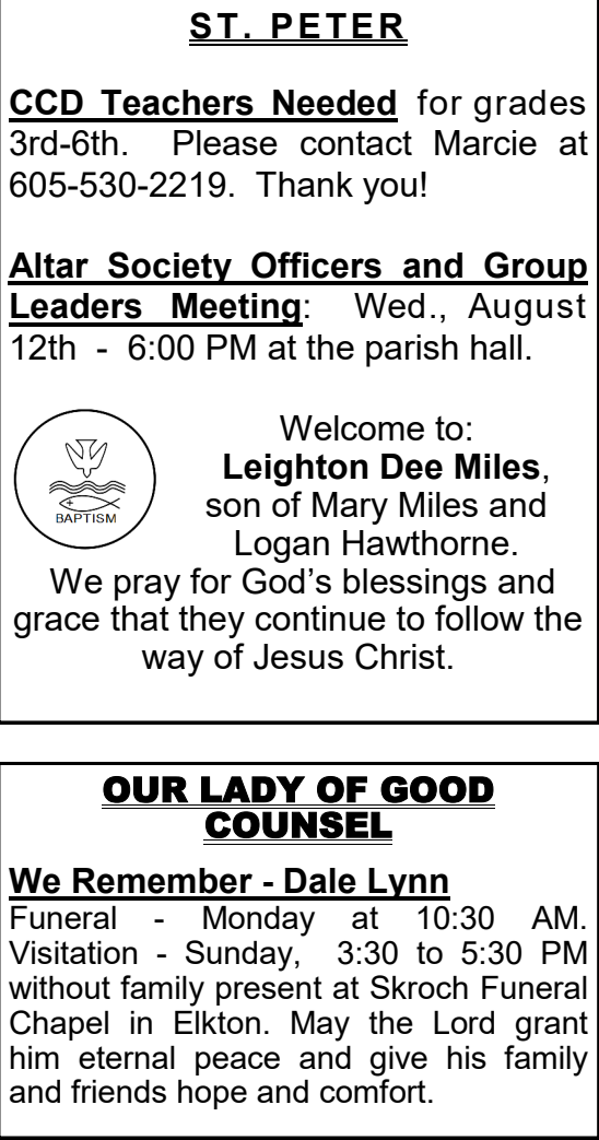
19TH SUNDAY IN ORDINARY TIME