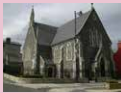
St. Joseph's Newtown