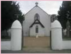
St. Patrick's Kilquade