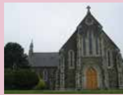
Carmelite Church Delgany