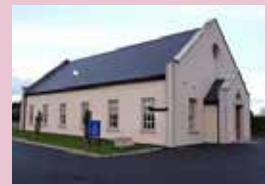
Holy Spirit Oratory Newcastle