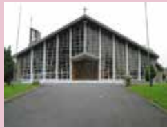
St. Anthony's Kilcoole