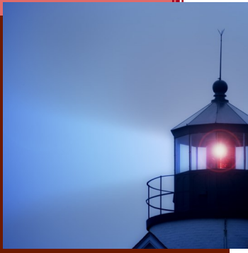
"A light shines in the darkness for the upright and the strong"

Darkness: where the seeds of conversion are thereby sown; and the light that shines makes it known .